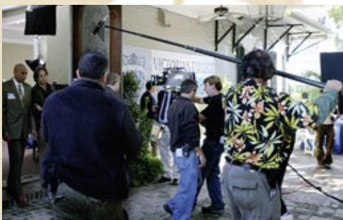
A walk and talk scene using the Steadicam